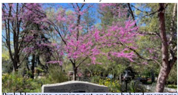
Pink blossoms coming out on tree behind memorial

Spring Meet planning to begin. We've added new equipment to our 2024 Insurance policy.