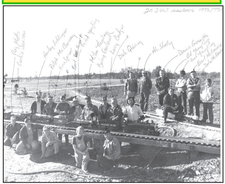
SVLS photo dated 1973 with 20 members.

This May is our 45th anniversary as a club.