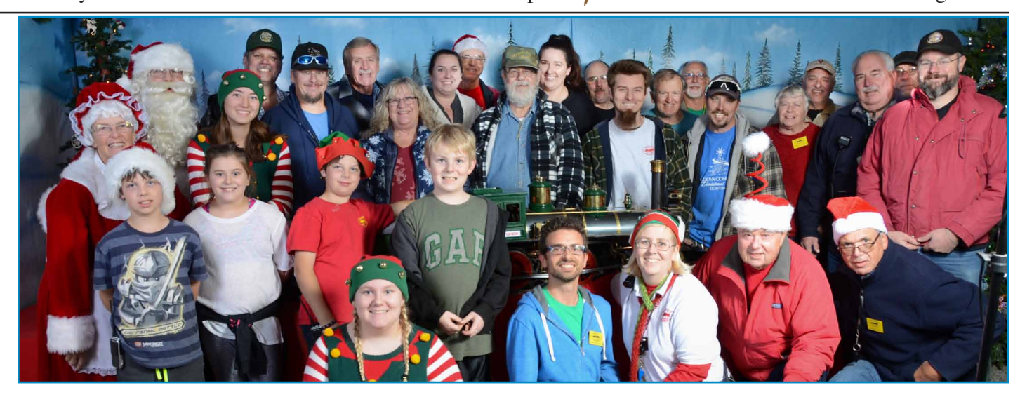
2017 Santa Train Event volunteers, Thanks all!