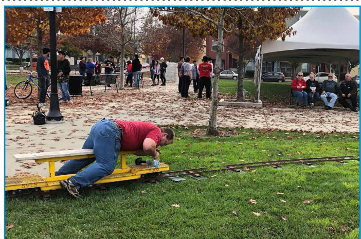
Our Track Super is just rolling along checking the portable track at the Rrancho Cordova tree lighting

accomplished. While we can always look back and say this or that should have been done, still, I believe we should be happy with what the Club has achieved in the past 12 months. Some of the accomplishments and highlights of the year include; The trip to Reno on AMTRAK, com-pletion of the fence around the steaming area, building of the shelter, installation of the hydraulic loading lift, building and installation of a chemical toilet, a manned booth for three days at the Sportsman's show in Cal Expo, a two day exhibit of steamed locos at the State Railroad Museum, 2 successful Meets complete with banquets, a special run day for the Air Force, acquisition of a large metal storage cabinet, 13 new members and a host of new friends. All of these things came about through the hard work of a fine Board and the many members who put in their time, money and effort. I want to thank you all, men, women and children, for there were whole families involved in these efforts, for making this such a rewarding and pleasant year for me, as President. Everyone have a wonderful Holiday Season and the best ever New Year. - signed Dick Esselbach.