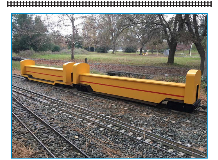
Work on the new riding cars continues as two of the four are now completed.