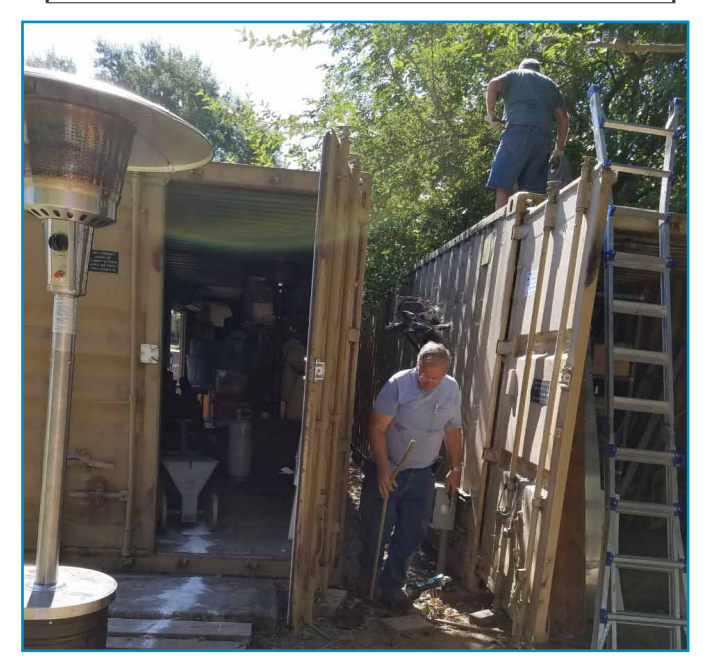
Cleanup work being done so containers 1 & 2 can be moved. New footings to be done so all three containers are moved back along the back fence.

The Red Barn by our Station is having a fund raiser On September 30. We plan to run one public train that day and will make a donation to the Red Barn Fund from our donations. We will be running from 11-2. There is also a large party (2 trains) from 11:30-2:30 that day so we will be needing crews to handle both events.