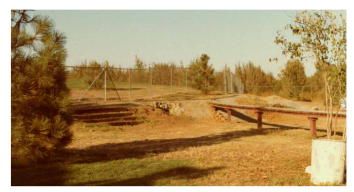
No Boxcar, passenger station or siding. Just one lead from the turntable onto the main. 1976 is most likely the year of this photo as well. The pear orchard is well represented in this view. The fruitless Mulberry trees that provided much needed shade soon became maintenance nightmares and all are now gone.

Around 1972 we were asked to display our 1" scale 0-6-0 at the