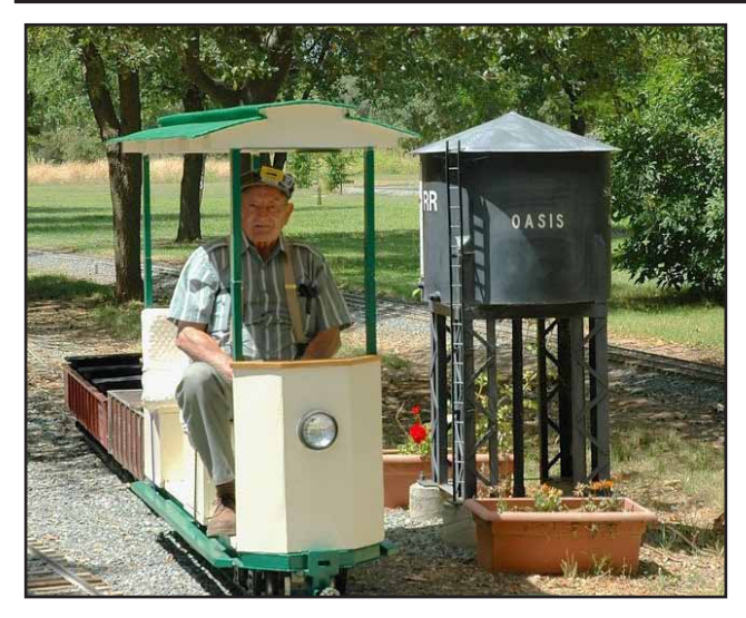
Trolley for Sale.

Price $1500 OBO, plus engine stand for sale. Call: Clio Geyer (916) 645-9154