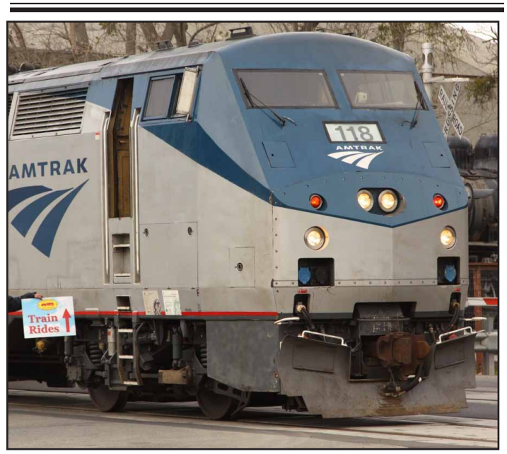
We now offer larger scale train rides.