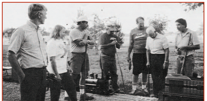
Picture of the rail joining crew, August 1994.

20 Years ago: Our August Meeting was held at the track and we had a wonderful turnout. There was a very short business meeting and then we got down to the big event of the evening - the completion of our last section of mainline in the expansion area.