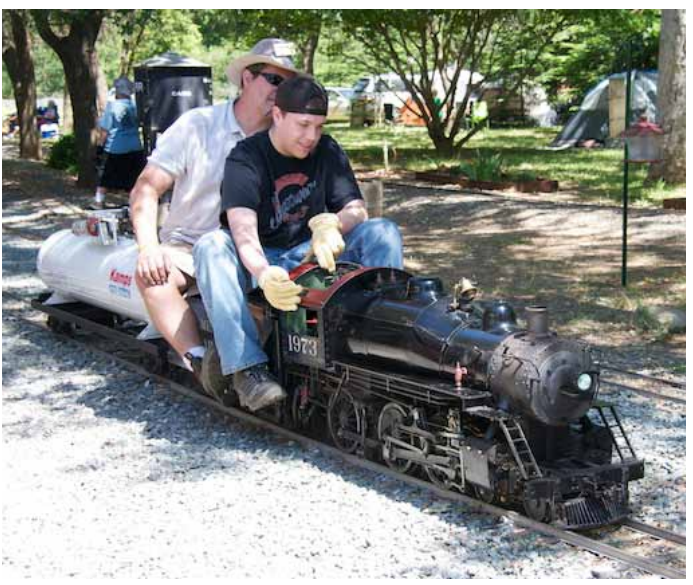
Sights and sounds of the 2014 Spring Meet