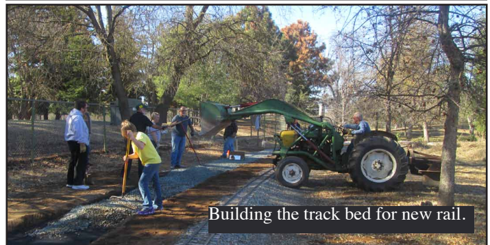
Building the track bed for new rail.