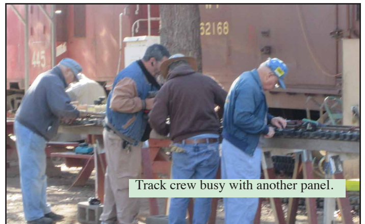
Track crew busy with another panel.