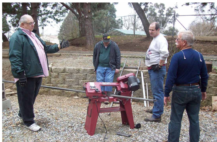
Even a powered hack saw takes many members to insure it is cutting straight.

Now that this new irrigation project is completed one area that is hard to water and mow is the small flat area east of North Midway Siding, next to the grain building. What would be nice is a member with a little building talent to build some more buildings to fill in that area. It would add some more appeal to the area and is a great project to do at home. A great way to contribute when you can't make it to the work days. Come on talented members. Let's think of something cool to fill in the space.