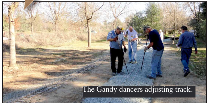
The Gandy dancers adjusting track.