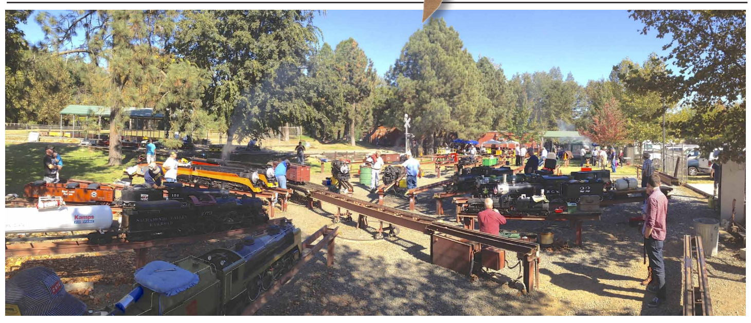
The Fall Meet was Great Fun, we had 103 people registered showing 47 pieces of equipment. Great variety of equipment shown.

www.svlsrm.org November 2013 Volume 40, Issue 11