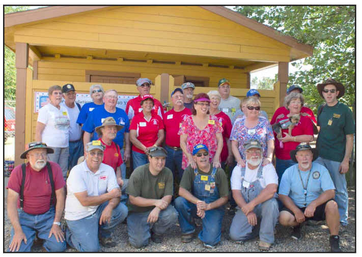
The Volunteers from Sage Brush Short Line