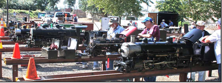
Steaming bays were very busy during the three day meet.