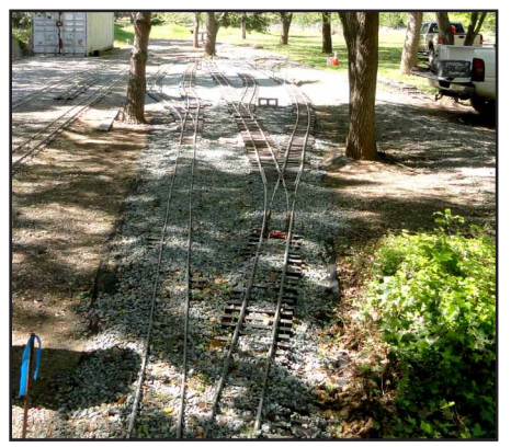
Enhanced Oasis Hump Yard.

cones with your train's ID number to reserve a siding during the meet. Select a siding that will fit your trains length. Hope to see you at the Spring meet.