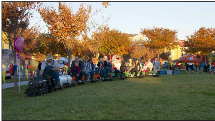
Giving rides at the tree lighting event.