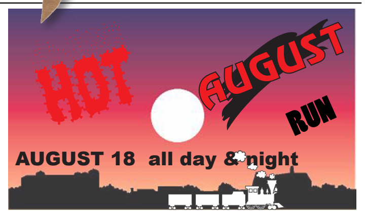
Come to the track for a Fun Time Train Run and Pot Luck Dinner. Dinner at 6 PM. Show up anytime during the day to run your train.

Join us during the day and run your trains into the night for a good old-fashioned evening of Live Steaming SVLS style. Come early and bring the kids. Bring your engine and some rolling stock.