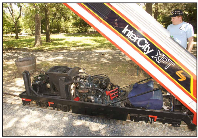
These engines have diesel motors and transmission. The were built using off the self parts or parts from car savage yards. Sitting in them and driving gives a new perspective of the track