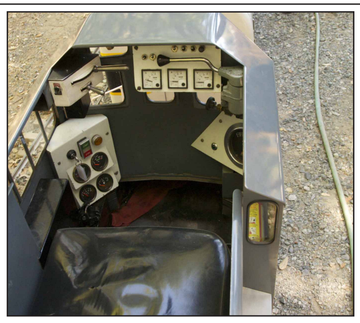
Above picture is the cab of the electric "Vine" engine which shown below uses a gas engine to drive a DC generator which then powers the electric motors in the trucks