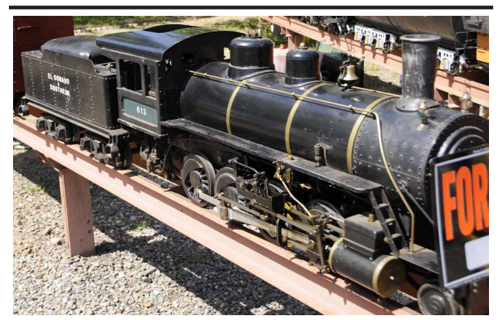
Allen Consolidation Steam engine and Tender

FOR Sale, a complete set of Allen Models 2-8-0 castings, with out boiler, the asking price is $2400.00, or best offer. Contact Robert Stroud at 541 526-5726.