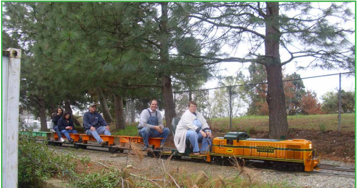
Members run day. Boiler testing and riding the rails. Rain held off, and it was a day to play, too.