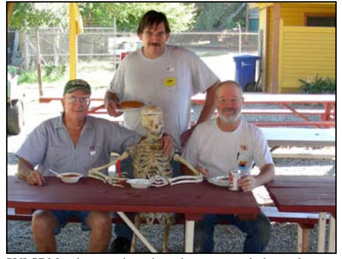
SVLSRM volunteers have been know to work themselves to the bone.