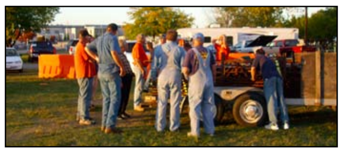
How many SVLSRM volunteers does it take to load a trailer? Simple answer Many - Thanks to all that helped at RailFair.