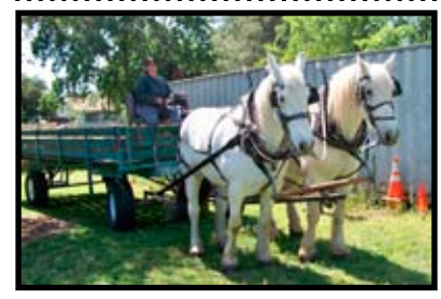
Park's Kids Day: Kids were given hay rides from the far end of the park to our station for train rides.