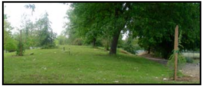
New trees on East hill by twin bridges