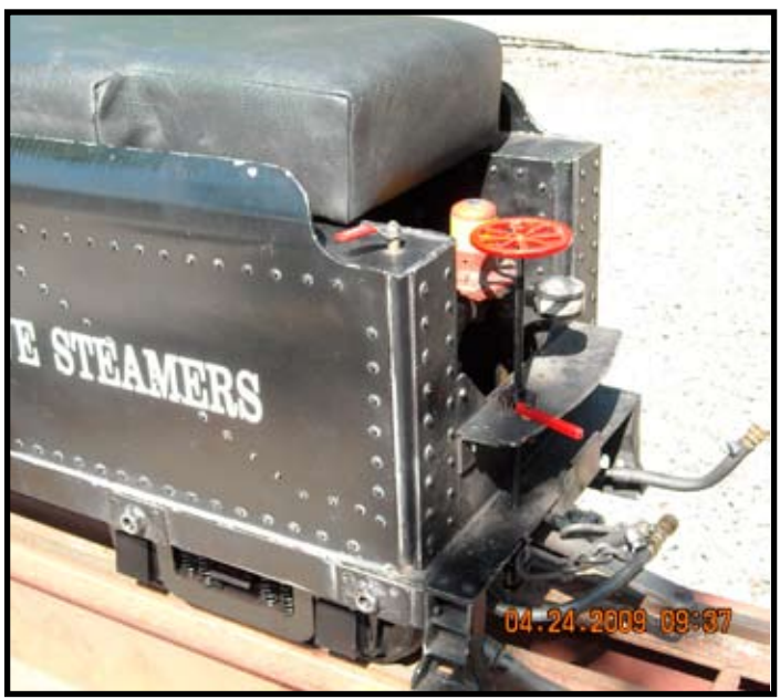
New Brakes on tender controlled by engine or hand wheel