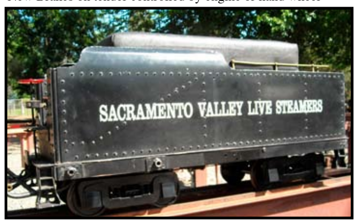
Two new smooth riding trucks.