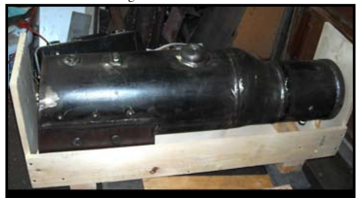
New boiler for our steam engine.