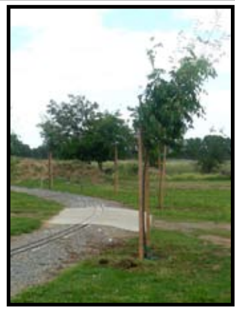
Many new trees along Midway and the main line at South Cobbie Creek.