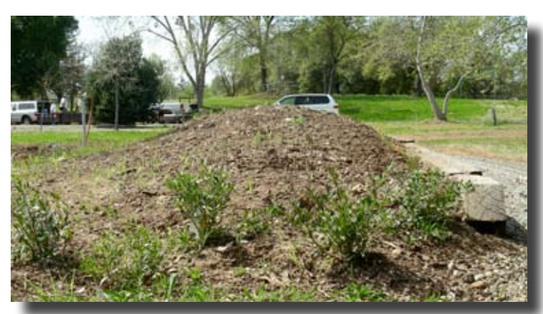
Andy Bercheilli has been busy also planting plants on "Thorley Berm", also a new water spigot was added just west of the berm.