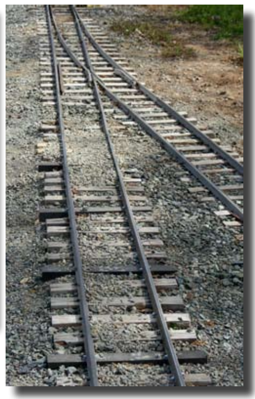
The switch at Hill View West has a new smother ride and sound. The multi-spliced rail has been replaced. Now instead of many joints inches apart there are two joints 12 feet apart.