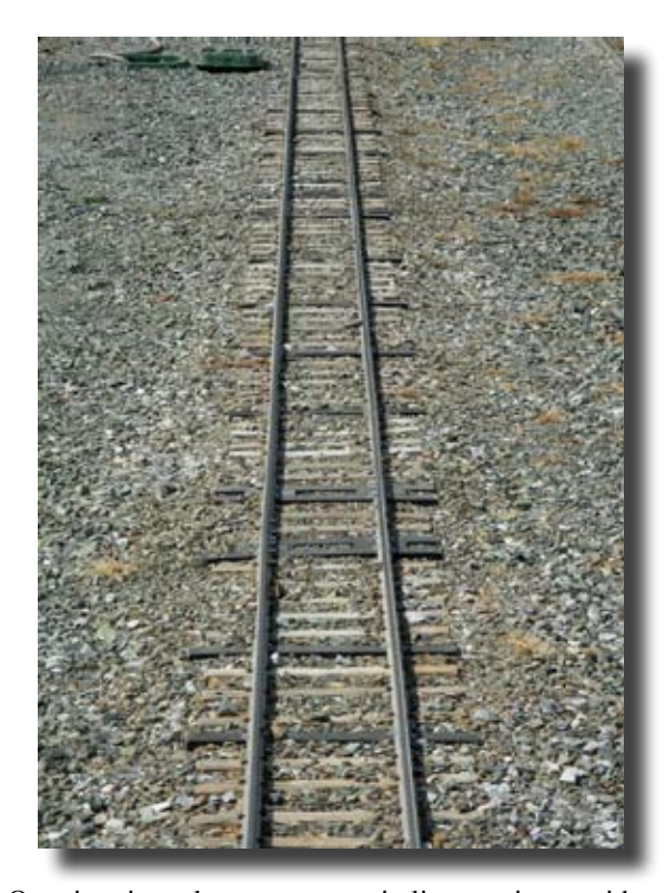
Ongoing tie replacement on main line continues with replacing every 5th tie with a plastic tie and new long splice bars with extra tie support under each joint.