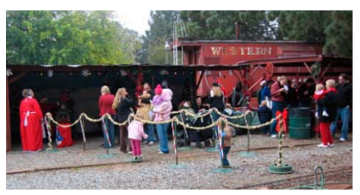
People getting their photo taken with Santa and enjoying cookies and warm drinks.