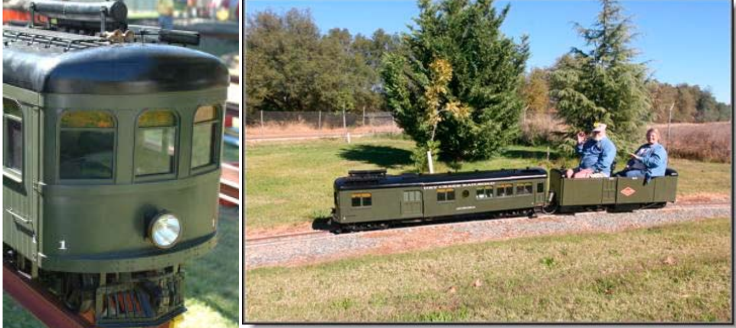
An Andy Clarici original one of a kind. Hall Scott car with trailer car 7.5" gauge, roughly 2" scale. Last ran in September.