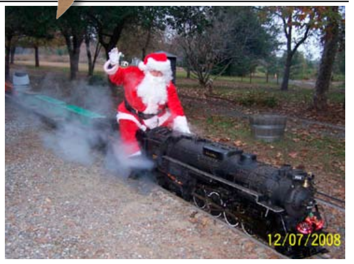
Santa arrives in style on 8 drive wheels instead of 8 reindeer.