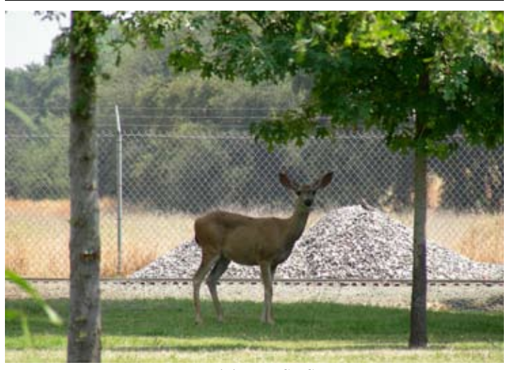
Recent visitor at SVSLRM