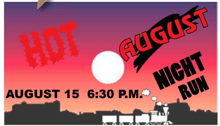
Bring your Train and your appetite and food to share. Join us for a Pot luck dinner and a fun evening around the old railroad tracks.