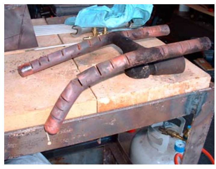
This was the burner being used by our Steamer. As you can see it has warped a new shape.