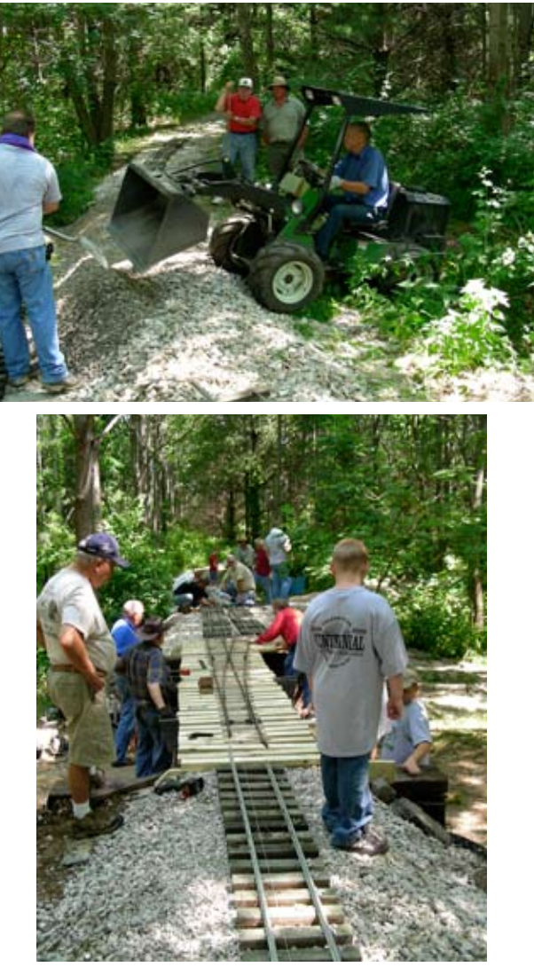
They had a good turnout for work day, with several crews working on different sections of the railroad. - They were a good hard working group of people.