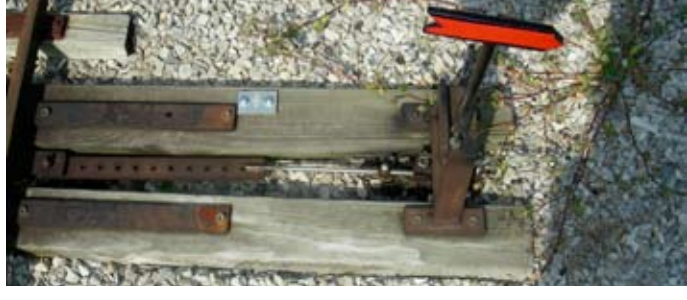
Yard switch indicator, also they have just numbered their switches (small tag in photo)