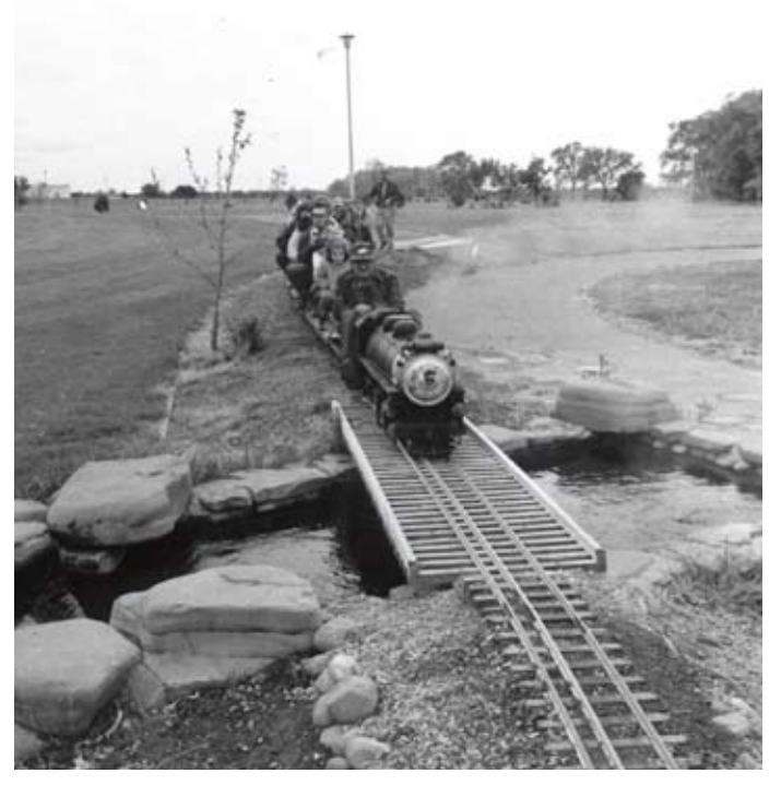
Our early years.

George Westinghouse (1846-1914) created many inventions. He also designed the use of block signals for railroads, a rotary steam engine and many more patents. He bought Tesla's patents for alternating current and demonstrated the use of AC instead of using DC to provide electrical power to towns.