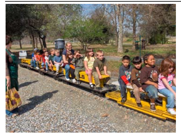
One of our recent special train runs was for the classes at the Cordova Park Pre-school.