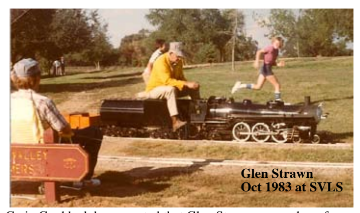
Craig Craddock has reported that Glen Strawn, a member of SVLS for many years, passed away on September 11th. He was 76 years old.

First of all, I would like to say Thanks to the track crew for there help in the rail replacement project. The track crew installed 400 feet of steel rail and replaced a lot of bad ties. Its time now to get ready for the fall meet and help will be need to clean up the right of way. The 1" sale track will be ready and I need some one to bring their equipment to test the track before the meet. Contact me so we can set a date. See you at the meet!