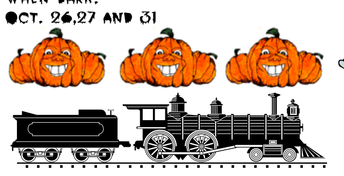
SPECIAL RUNS FOR OCTOBER - By Clio Geyer

contact Lois Clifton (916) 722-8514 loisjune1@comcast.net