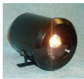
Figure "8" MARS LIGHTS are available again and have been upgraded with an "LED" in stead of the incandescent bulb. These LED's put out over 50 lumens of light and the LED's have a reported life span of 100,000 hrs...