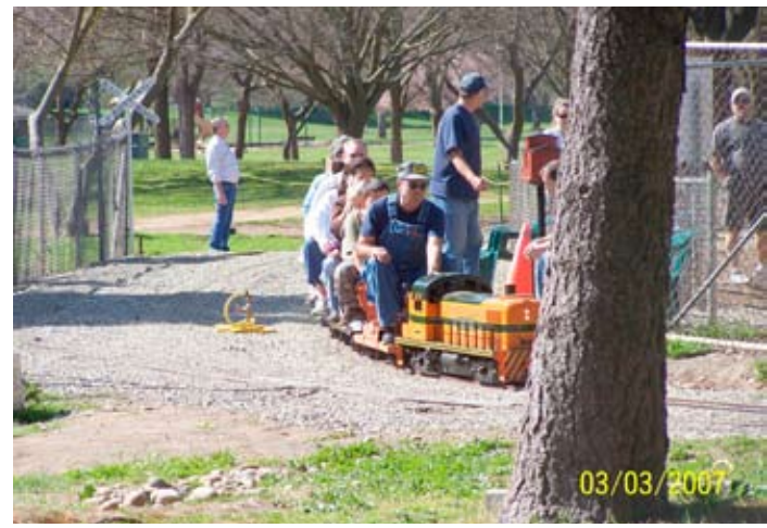
March 3rd run day. - trains using new rail through the station.

There is still more work to be done on this project and other projects. Please do your part and volunteer.