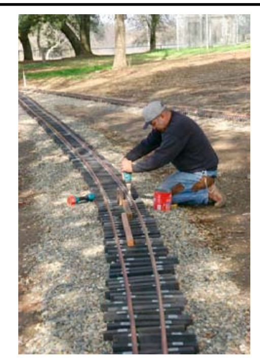
Darrell placing rail on new ties with tie plates that were pre set to correct track gauge.

410. Before leaving the steaming area operating steam locomotives shall have steam pressure brought up to operating pressure, have safety valves and pressure gauges checked and operating correctly, have water gauges and try cocks blown down, have feed-water devices checked and in working order, have whistle tested and operating properly, and have brakes checked and operating.