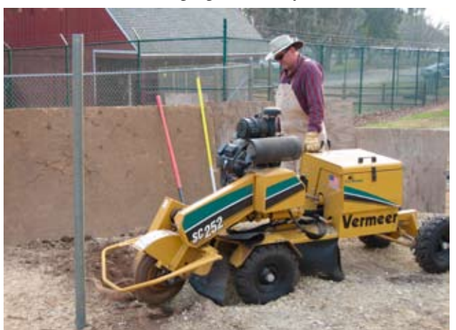
Lee Frechette helping with stump grinding.