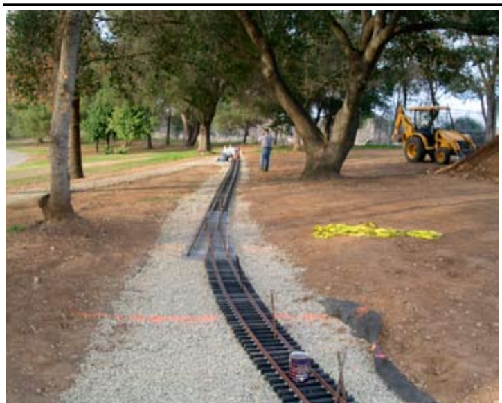
Rail being added to ties for new station track.