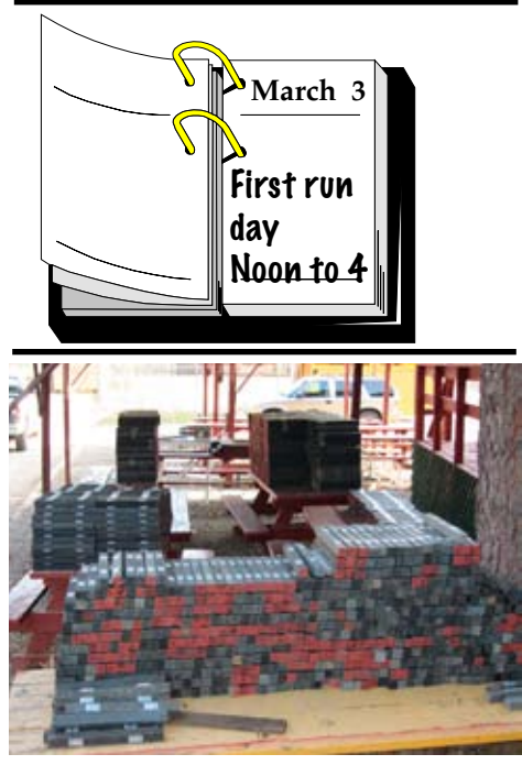
Ties, ties, ties, ties, ties, ties, .....

As we prepare for our operational year, we trust you are getting your equipment ready as well. We all look forward to a great vear of live steaming!