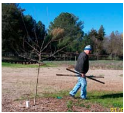
Paul Skidmore doing multiple tasks.