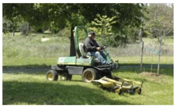
Paul Skidmore making fast grass cutting with the big mower.