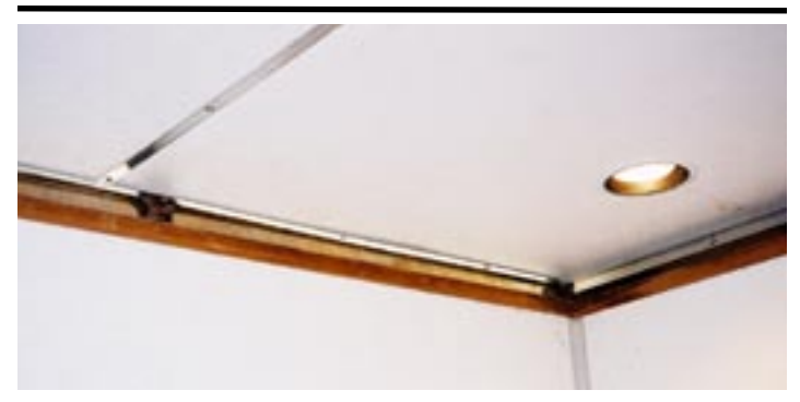
Sound barrier installed between wall and ceiling in our restooms. Thanks Dale Folwar.