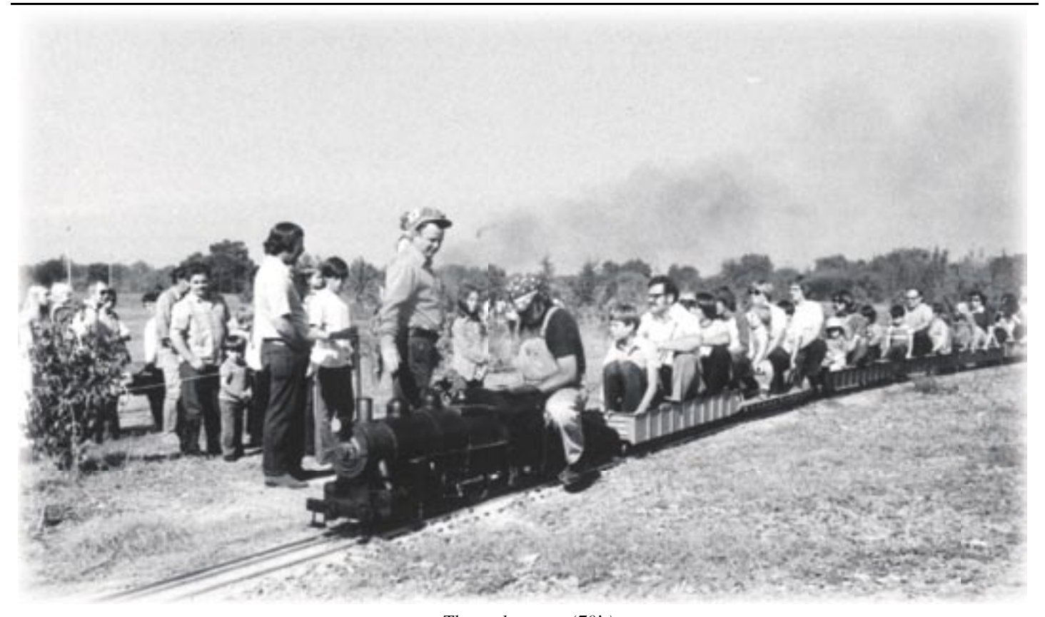
The early years (70's)