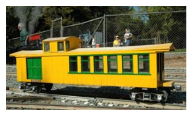
One inch scale car on display from Casey Wilmunder.