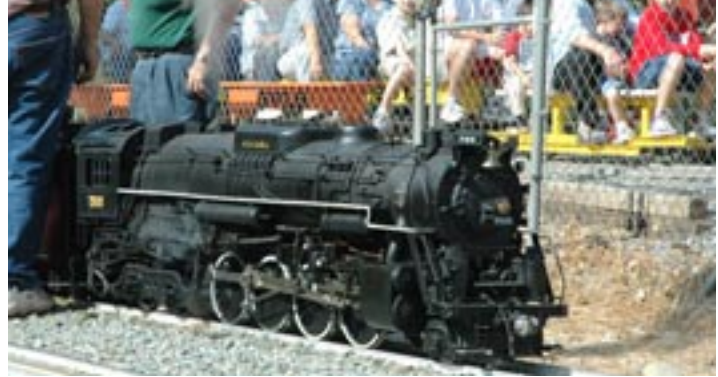
Gil Beaird's Berkshire locomotive. He had two new water tank cars (below) to provide water for long hauls like at Train Mountain.