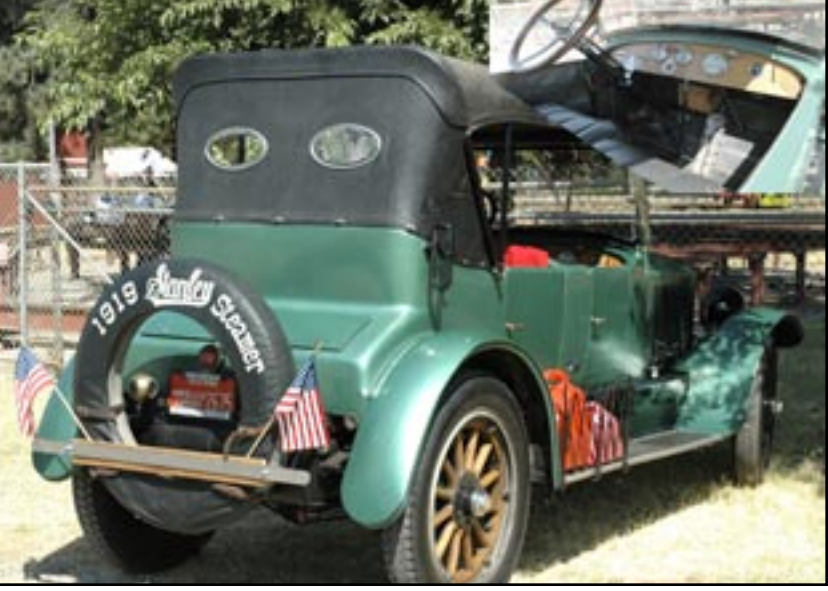
Standard gauge steamer. This 1919 Stanley Steamer was at our track this weekend after being in the parade. Several members were privileged to have a ride and reported the car had good power and was very very quite. Note the water gauge on the floor board.