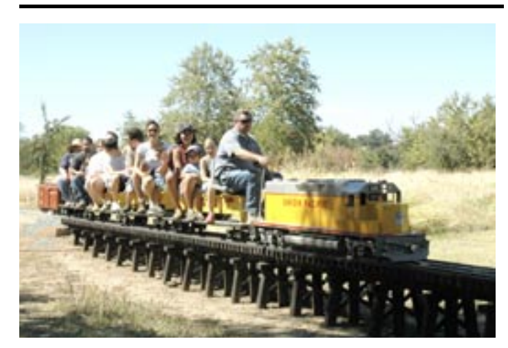
The GP-40 pulling a load of passengers after 2nd day of testing and all seems great with the rebuilt engine. THANKS to all that have helped make this happen.

Due to several calls and comments, I asked the Board members and others attending the Board meeting what they felt the rules should be about vehicles on the track. This includes any kind of railroad prototype, handcars, speeders, bicycles with flanged wheel assemblies, lawn mower powered assemblies, etc. The consensus of opinion is that anything that meets wheel standards so as not to cause damage to the track is okay to use. The only exception is to this rule is that human powered equipment or equipment of any type can be ruled off the track by a board member if there are perceived safety issues or during the time public hauling trains are in use. Also, when the public is on trains, kids should not operate equipment on the rails.