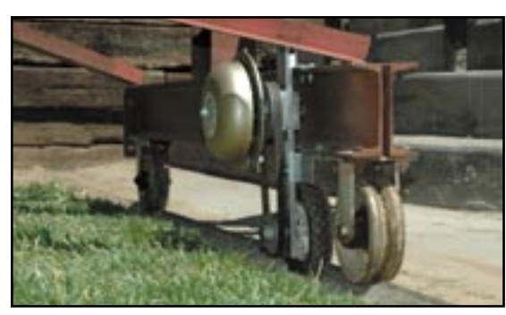
Warning bell installed on transfer table by Bill Yoder.