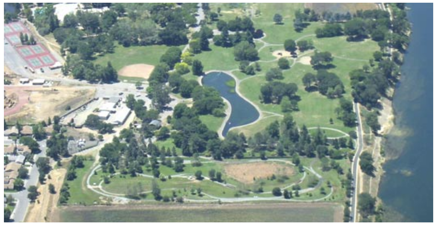
View from the East looking West.