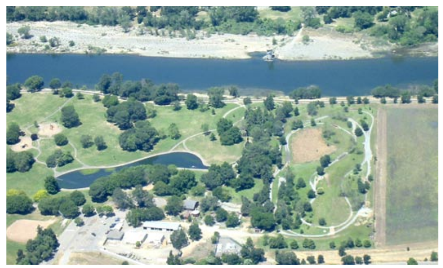
View from the the South looking North