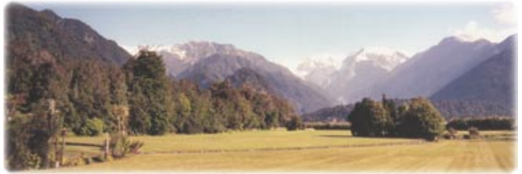
View from Milon's hotel room at Franz Joseph with the glacier in full view.

Further E-mail attention related to our insurance needs. Due to the accident at LALS that resulted in so Continued on page 5